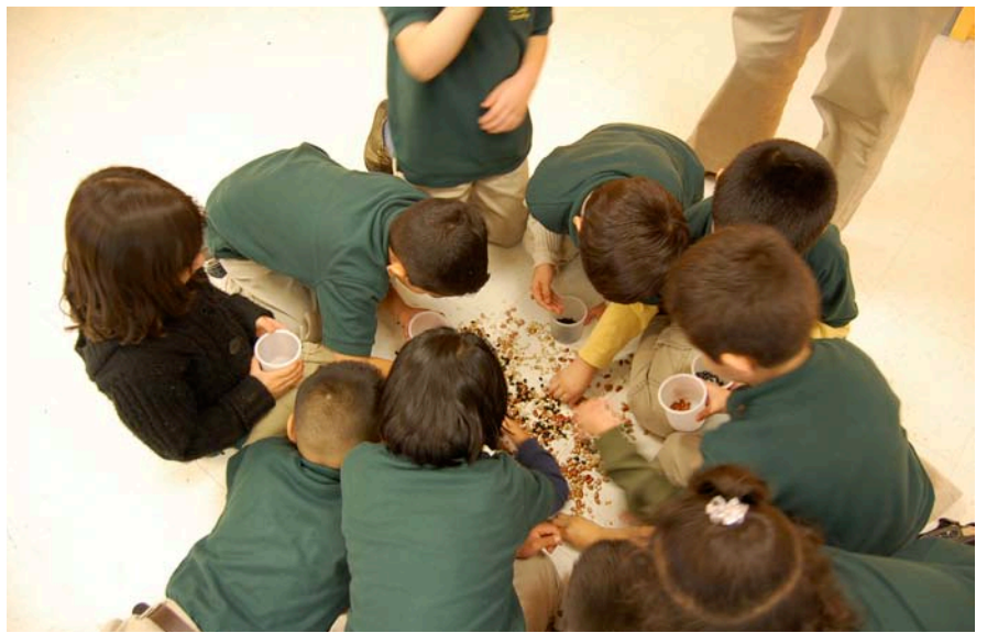
Using teamwork to sort seeds