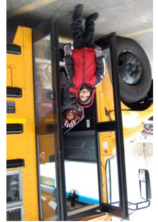
First ride on a school bus