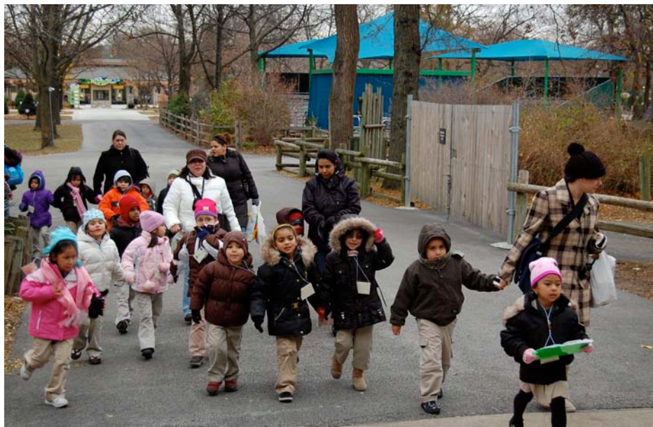
First grade field trip to the zoo

Diwali, "The Festival of Lights," is celebrated by lighting small clay pots filled with coconut oil to honor goodness in all people