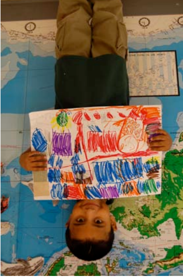
AGC artist at work