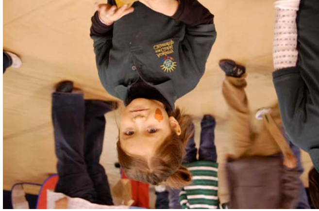
First annual AGC Harvest